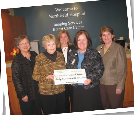
supporting Northfield's Breast Care Center